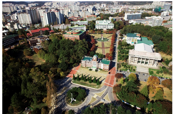
Aerial Shot of the campus