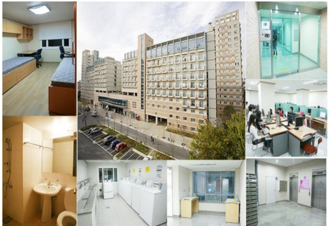
Dormitory Building 9 (BTL)

* The fee mentioned above is subject to change.